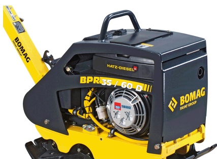
Robust and reliable Best component protection