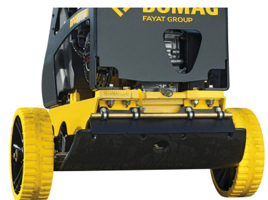
Simple and safe transport Transport wheels (optional)