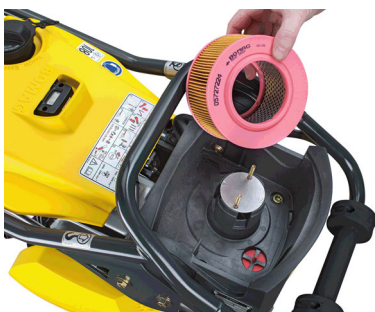
Maximum reliability and longevity All around engine protection