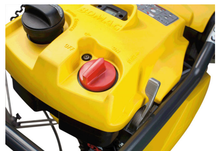
Simple operation Engine and fuel supply with combined switch