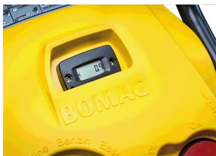
More transparency Hour meter RPM-meter with service indicator